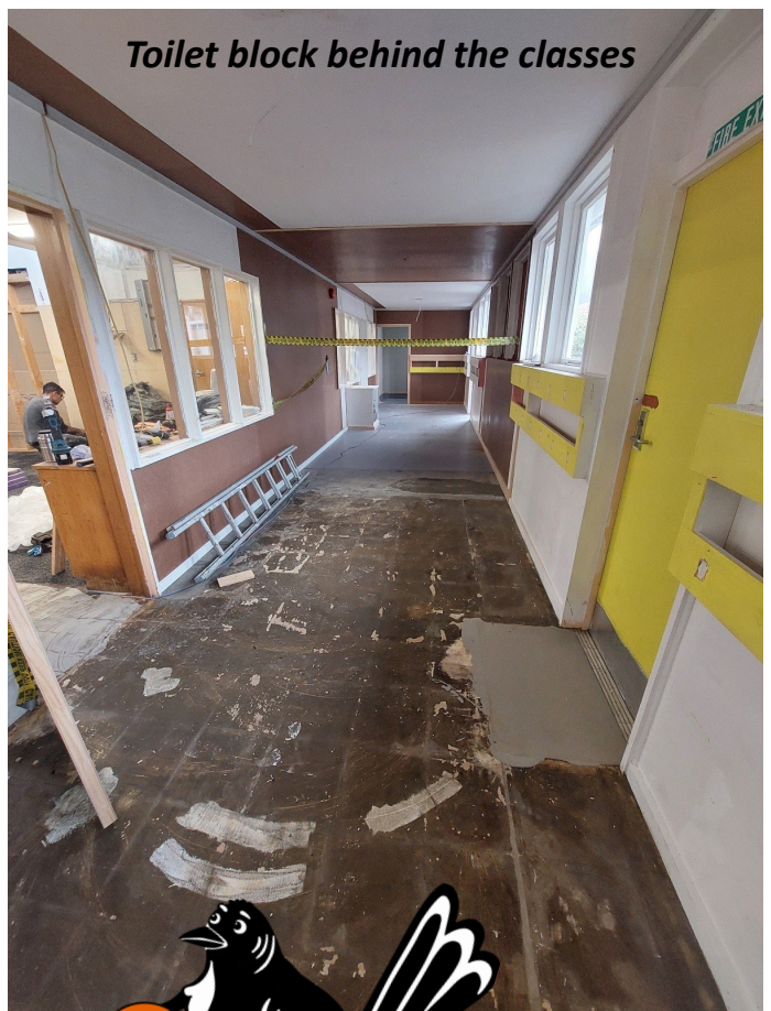
Toilet block behind the classes